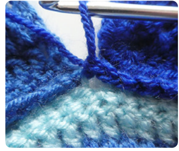
And both corner stitches should be worked through the same st of Big Shells.

Continue on as usual to the end of the central square, but do not work a sc into the corner stitch of the central square. Skip the corner stitch of the next square (another Nautilus Shell). Begin instead in the first of 3hdc ( which will look like the third hdc from the back ). Continue on to the end of the join as usual.